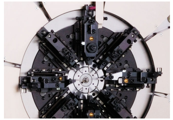
Tooling table without dead zone