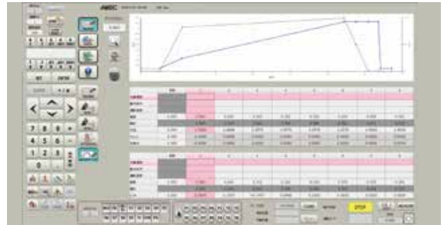
Program for number of coils (cylindrical coils) The program makes easy to adjust the basic coils.