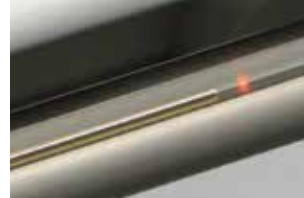
Image of automatic cutting